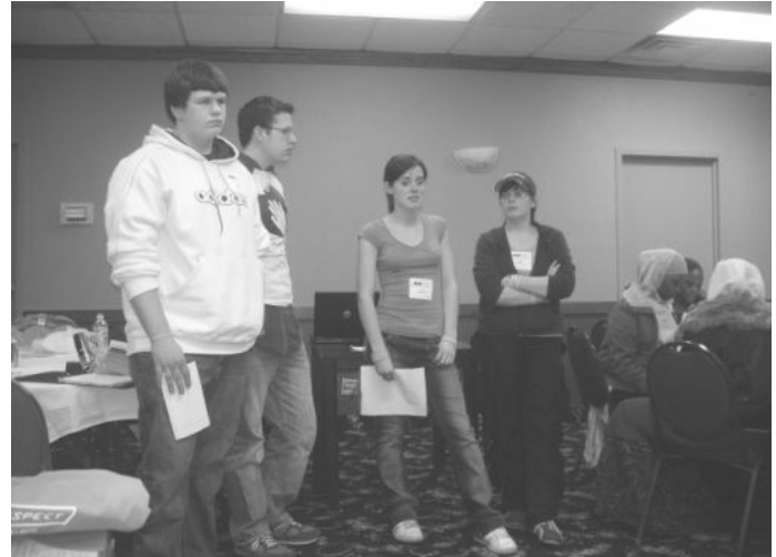
The Teens Against Dating Abuse Group train their peers on creating school-based prevention groups

effort focused on preventing teen dating violence and sexual assault by encouraging teens to engage in positive relationship patterns and intervene when they witness abusive behaviors.