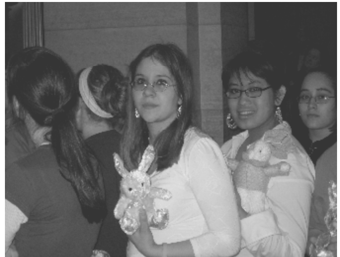
Teens present stuffed animals to remember victims of child abuse during the 2007 Violence Against Women Action Day Rally

that young women have more power to make change that we think we do," said another student.