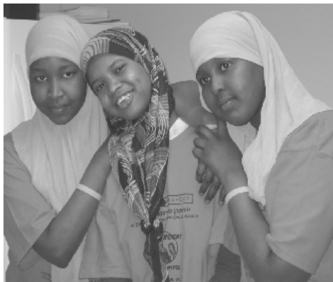
Students from the Minnesota African Women’s Association AGILE group at Choose Respect Teen Summit/Girls Rock! The Capitol, a February 2007 event to build leadership among youth to prevent violence against women and girls