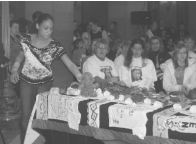
Presenting a stuffed animal to honor one of 2006's victims of child abuse

The theme for 2007's Action Day was "Invest in a Violence-Free Minnesota," as concerned citizens urged their legislators to invest in funding for victim service programs. The event was co-sponsored by the Minnesota Coalition Against Sexual Assault, the Minnesota Coalition for Battered Women, the Minnesota Indian Women's Sexual Assault Coalition, and the Minnesota Network on Abuse in Later Life.