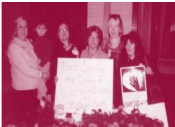
Staff and supporters from the Northwoods Coalition for Battered Women in Bemidji at the Violence Against Women Action Day Rally.